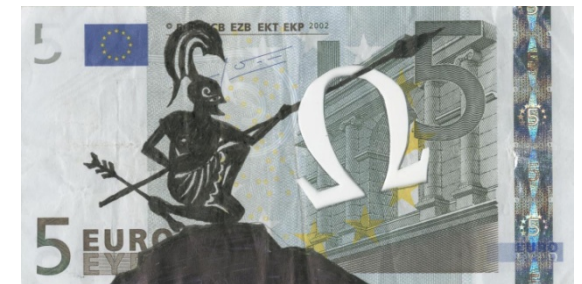
The Euro and Achilles