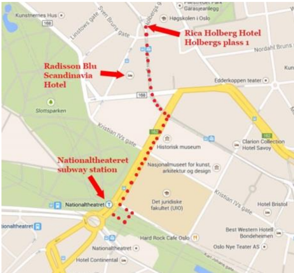
From Rica Holberg Hotel to Nationaltheatret subway station

2) Take the underground ( T-bane ) from the stop Nationaltheatret , which can be accessed from entrance marked by a blue 'T'. Take one of the lines #3 Sinsen, #4 Ringen or #6 Sognsvann, which all go in westward direction. Subways depart approx. every 5 minutes and the cost is NOK 30 (€ 4). Tickets must be purchased in advance (vending machines at the station, kiosks [Narvesen, 7-Eleven] or ticket counter). Take the subway to Forskningsparken station. When you get off the subway, walk straight ahead until you reach the entrance of the campus on your right hand side. Once at campus, Nils Treschows hus is the first tall building on your right side, marked with 'Det humanistiske fakultet'. The address is Niels Henrik Abels vei 36.