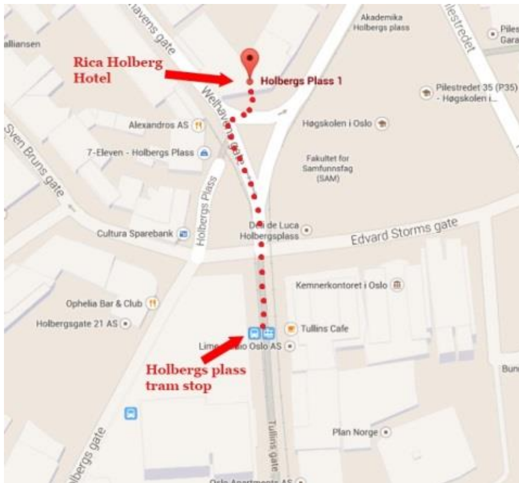
From Rica Holberg Hotel to Holbergs plass tram stop

1) The easiest way to reach Blindern Campus is by tram. The tram stops just outside the hotel (20 meters across the street). Take line #17 or #18 towards Rikshospitalet . Take the tram from the stop Holbergs plass to Universitetet Blindern . The travel time is approximately 10 minutes, and the cost is NOK 50 (€ 6) on board. If you purchase tickets in advance (vending machines or kiosks [Narvesen, 7eleven – there is one located next to the hotel]), the cost is NOK 30 (€ 4). You have to signal for the tram to stop (press the 'stop' button).