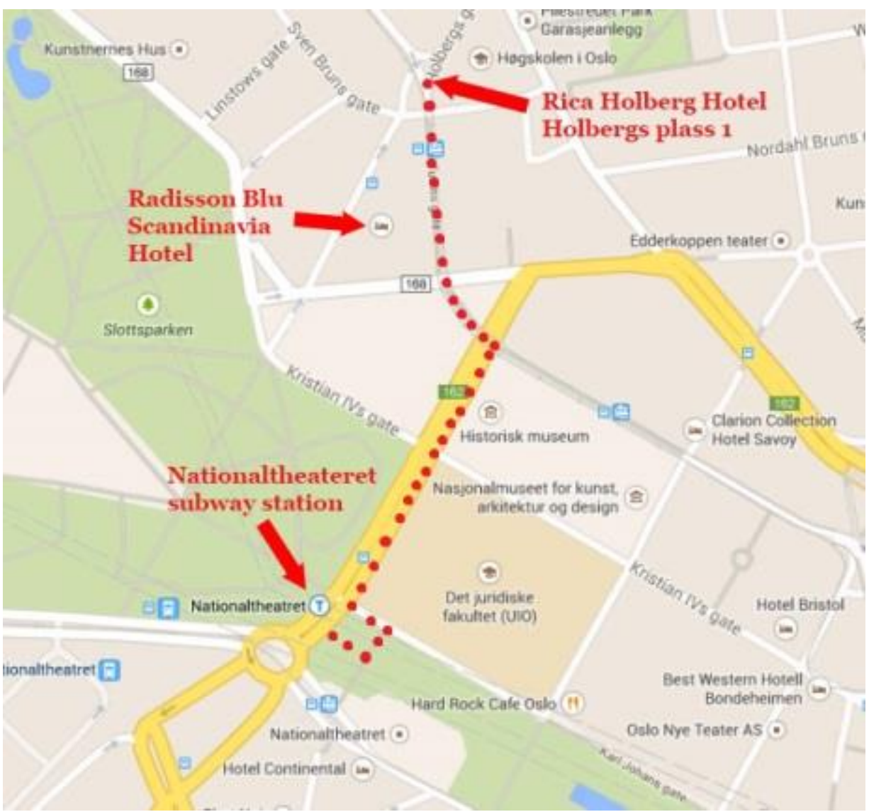
From Rica Holberg Hotel to Nationaltheateret subway station

2) Take the underground ( T-bane ) from the stop Nationaltheatret , which can be accessed from entrance marked by a blue 'T'. Take one of the lines #3 Sinsen, #4 Ringen or #6 Sognsvann, which all go in westward direction. Subways depart approx. every 5 minutes and the cost is NOK 30 ( \in 4). Tickets must be purchased in advance (vending machines at the station, kiosks [Narvesen, 7-Eleven] or ticket counter). Take the subway to Forskningsparken station. When you get off the subway, walk straight ahead until you reach the entrance of the campus on your right hand side. Once at campus, Nils Treschows hus is the first tall building on your right side, marked with 'Det humanistiske fakultet'. The address is Niels Henrik Abels vei 36.