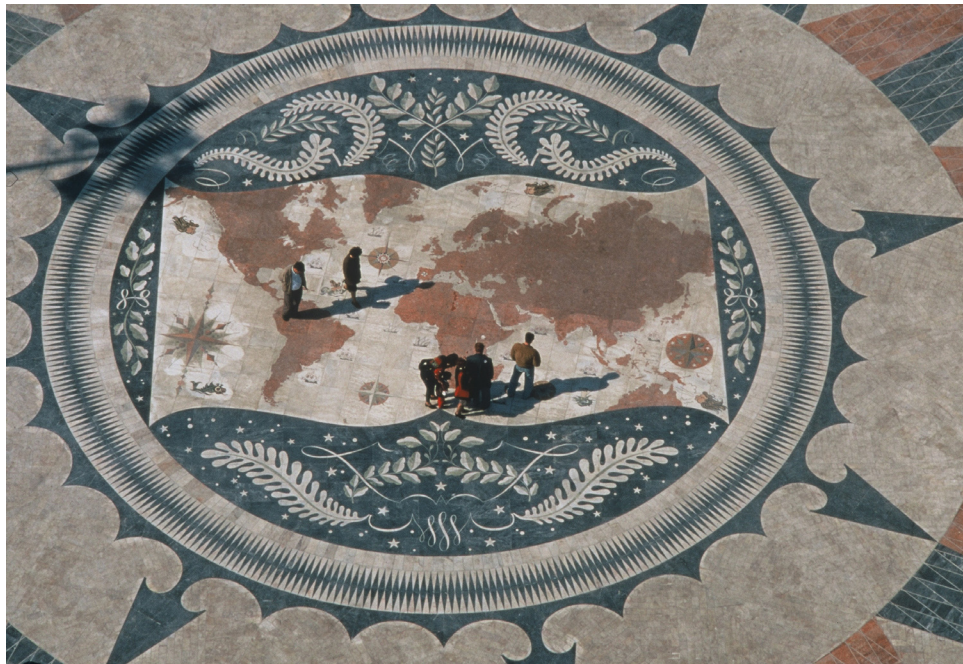
Lisbon - Monument to the Discoveries European Community © 1997