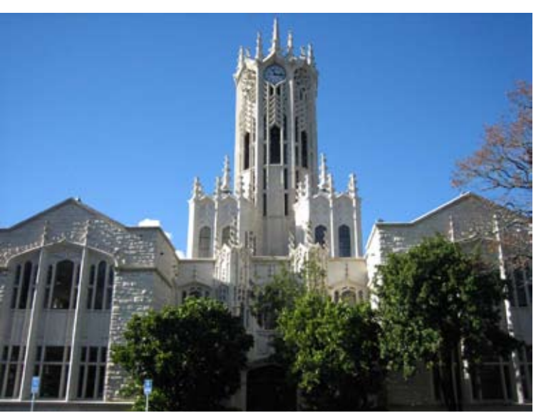
Clock tower at the University of Auckland

The team's multidisciplinary work programme is embedded in social policy, economics and political science, and consists of seven interrelated modules that between them explore the relationship between the range of social welfare regimes in the EU and democratic government. It seeks first to establish how the welfare regimes can be categorised, their commonalities, how they are changing and how the open method is contributing to the development of a European social model in the face of enlargement. It investigates