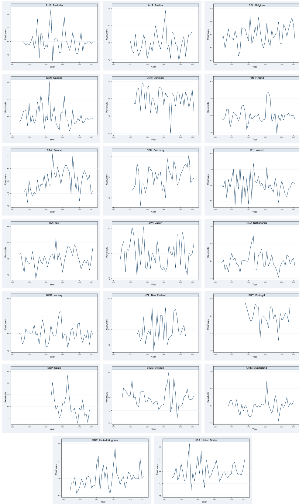
Figure B1: Estimated residuals of model 1 in table 1