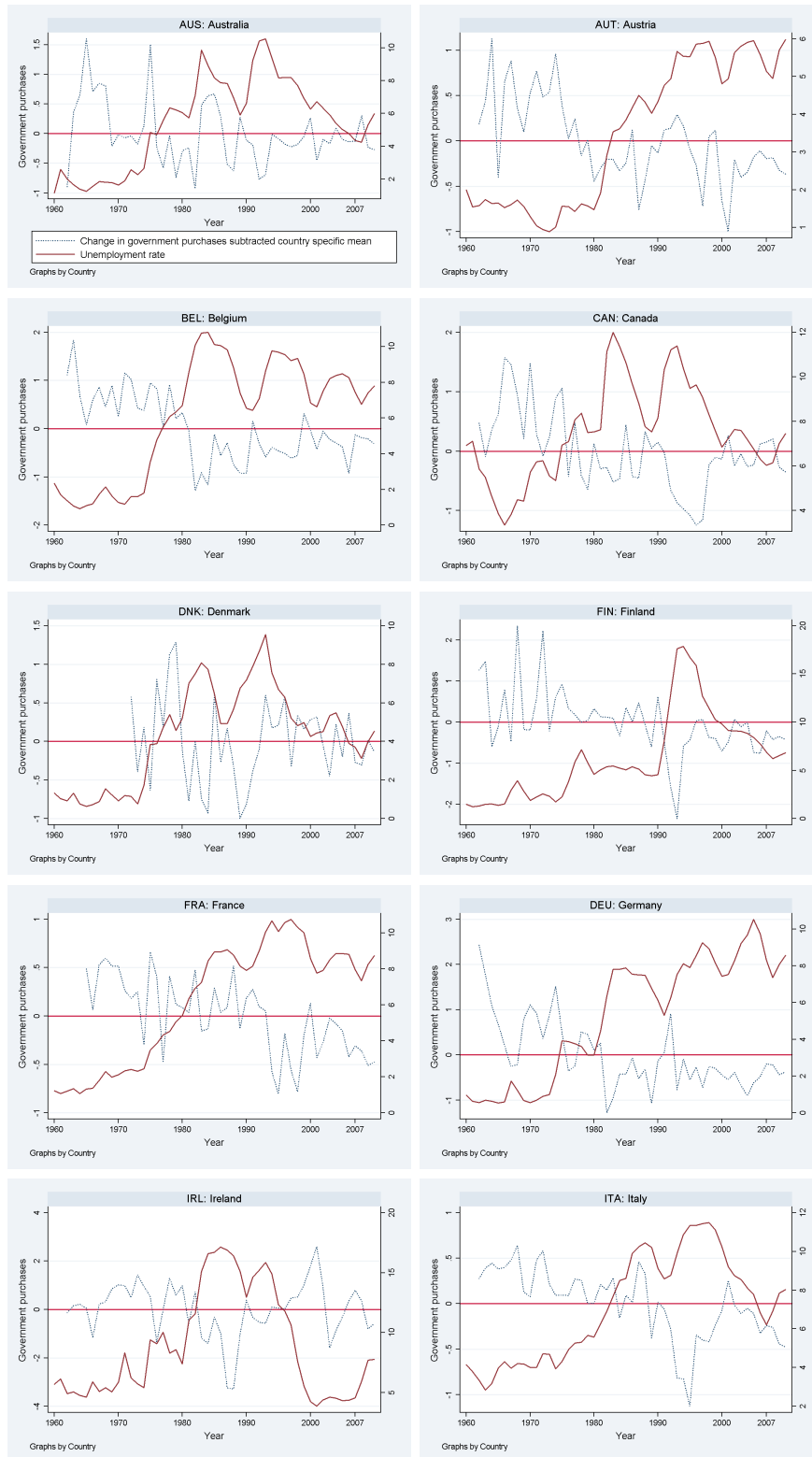
Figure 1: The change in government purchases, subtracted country specific mean, and the unemployment rate during the period 1960 to 2007